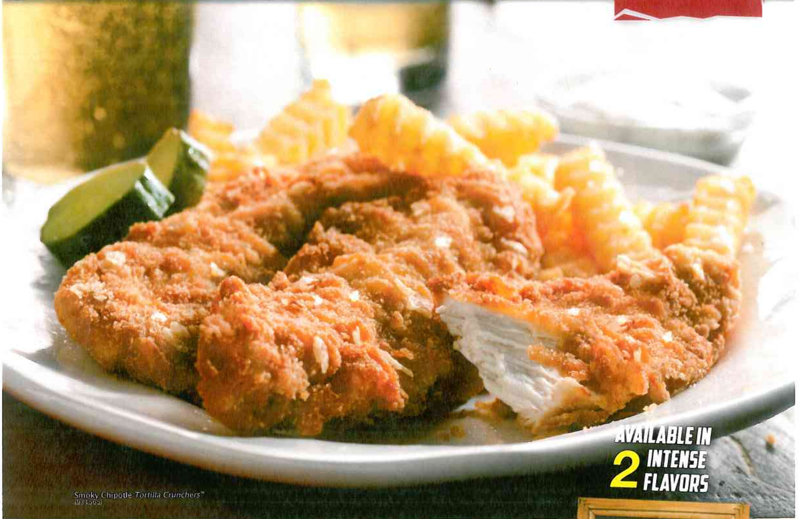
Smoky Chipotle Tortilla Crunchers™ (931562)