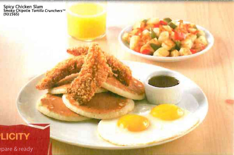
Spicy Chicken Slam Smoky Chipotle Tortilla Crunchers™ (931565)